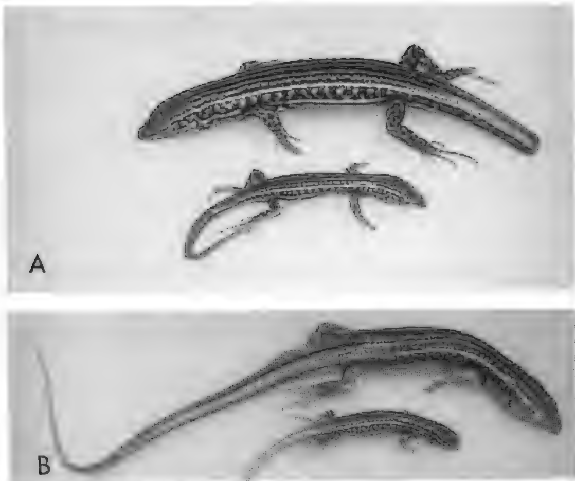
Fig. 2. Syntypes ( sensu Storr) of Lygosoma schomburgkii Peters. A, ZMB 4713a (upper; lectotype of Storr) and 4713b (lower) and B, ZMB 41236 (upper; lectotype designated herein) and 41237 (lower; paralectotype).

(Fig. 2), and provided useful comments on the manuscript. T. D. Schwaner and A. Edwards permitted us to examine South Australian Museum material, and checked locality data. N. Shea translated much of Peters' paper. B. Coulson provided Fig. 1B. A. E. Greer and R. Sadler also